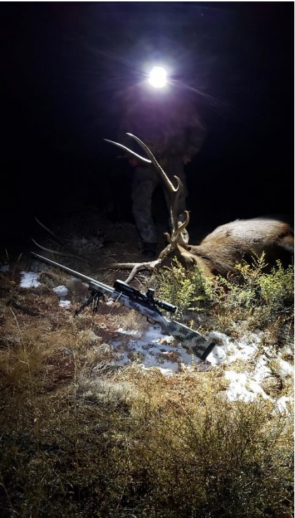
300 SS 225 Hornady ELD-M

*top end on pressure, max capacity, drop tube used