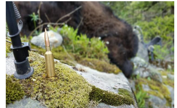
270 SS 165 Matrix

24" 1:8 twist 59.2 grains RL 23 2999 fps 2.266" BTO ADG CCI 200 62 grains RL 26 2979 fps 2.268" BTO Norma Fed 210 19.5" 1:8 twist 63.6 grains N 570 2853 fps 2.204" BTO ADG CCI 250 19.5" 1:8 twist 60.0 grains RL 26 2844 fps 2.204" BTO ADG CCI 250