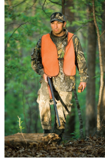
Missouri Department of Conservation©

■ Unassembled Firearms: Tax is imposed on sales of firearms, pistols, and revolvers that, although in knocked down condition, are complete as to all component parts.